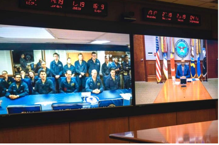
USS Chung-Hoon (Western Pacific)