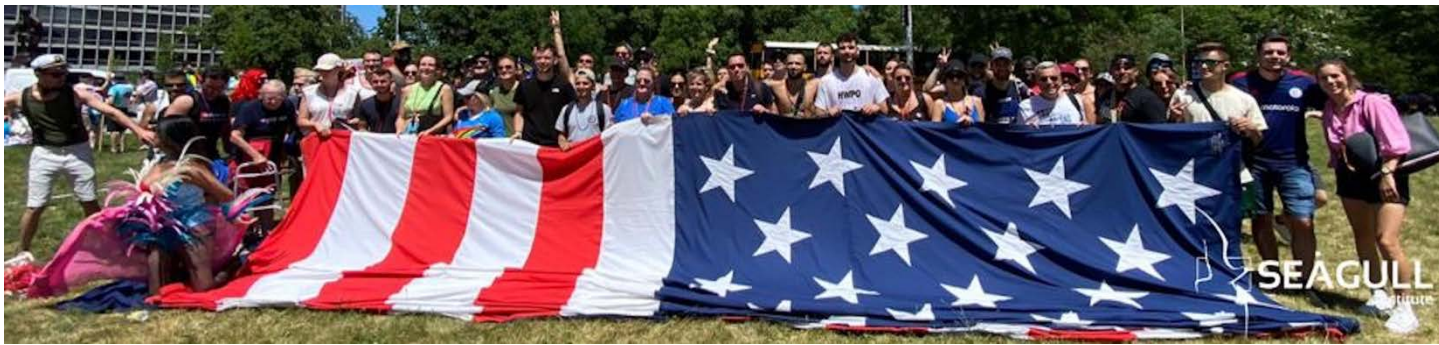
Photo Captions and Credits: Page 1, bottom right. US Army Pride, Troops at Camp Lemonnier, Djibouti, June 1