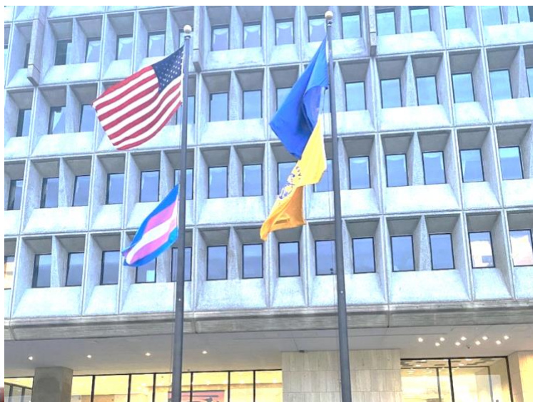
Transgender Pride Flag in DC